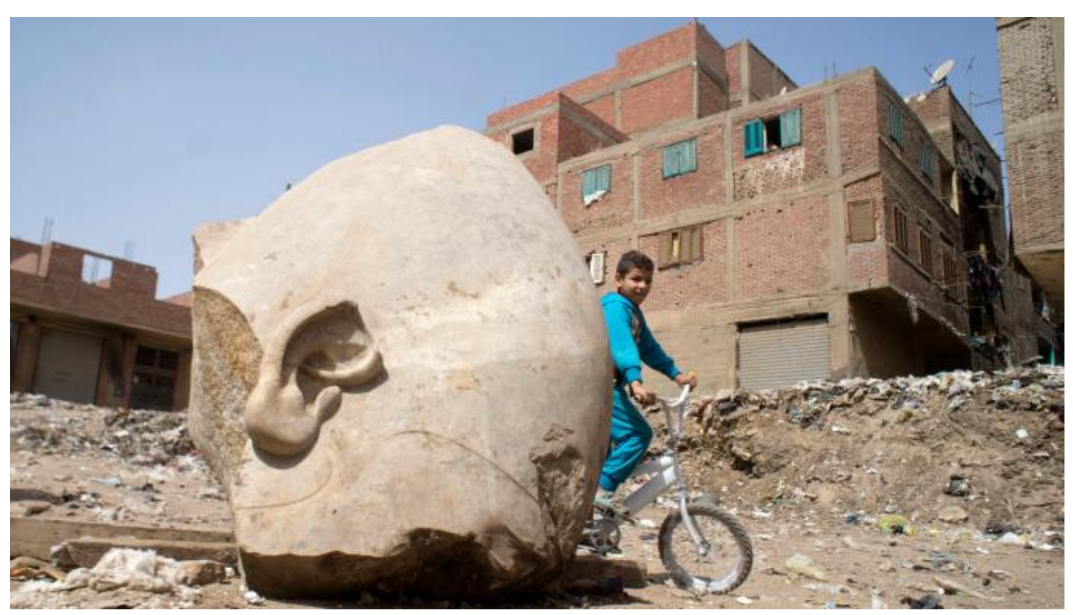
ART & ARCHEOLOGY NORTH AFRICA PRINT UNCATEGORIZED