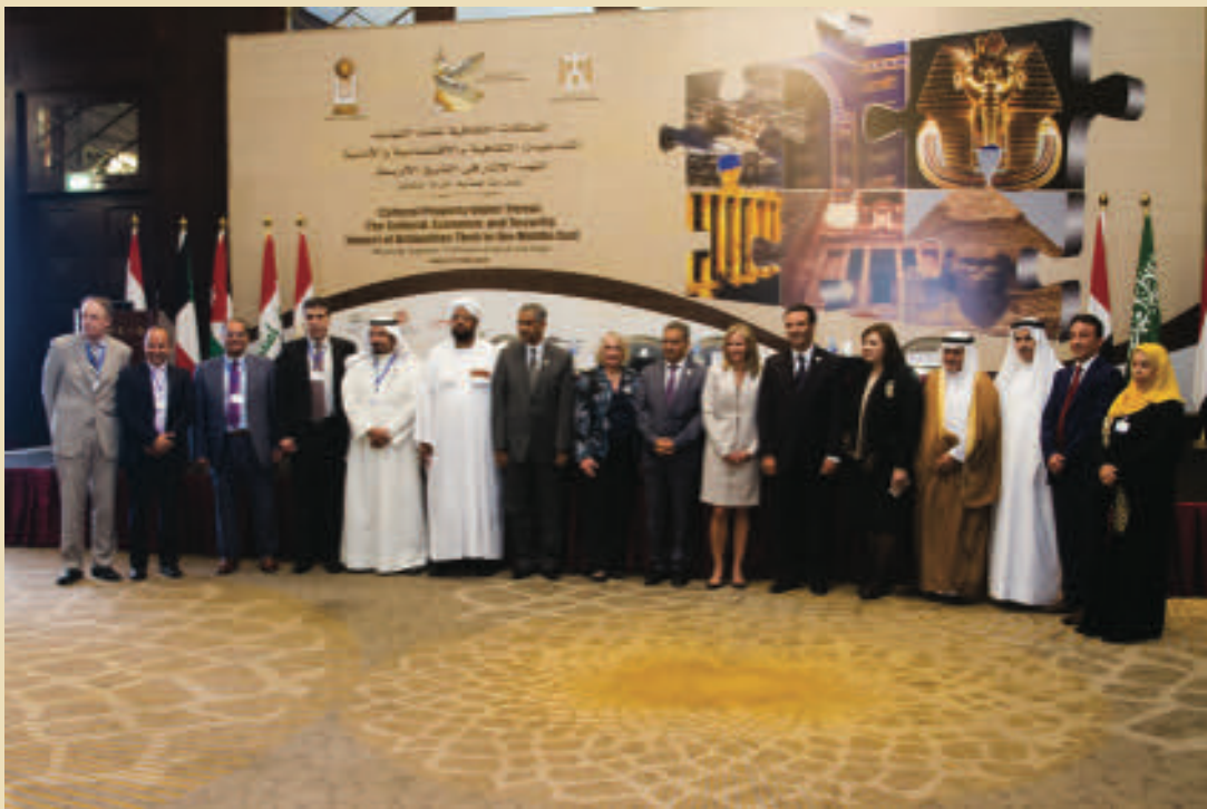
FIG. 3 Ten governments in the Middle East and North Africa sent representatives to the Antiquities Coalition's Cairo Conference.