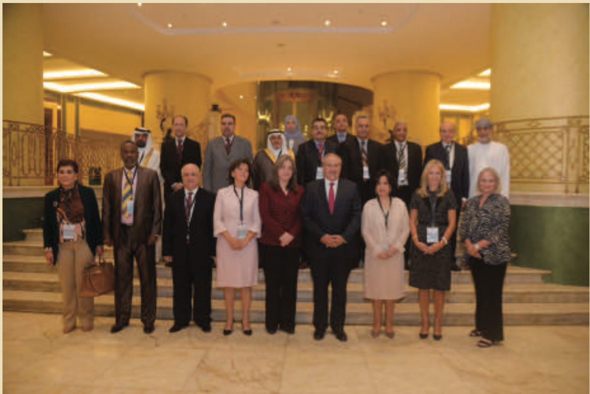
FIG. 4 and FIG. 5 Attendees at the #CultureUnderThreat Conference in Amman, Jordan, in 2016.