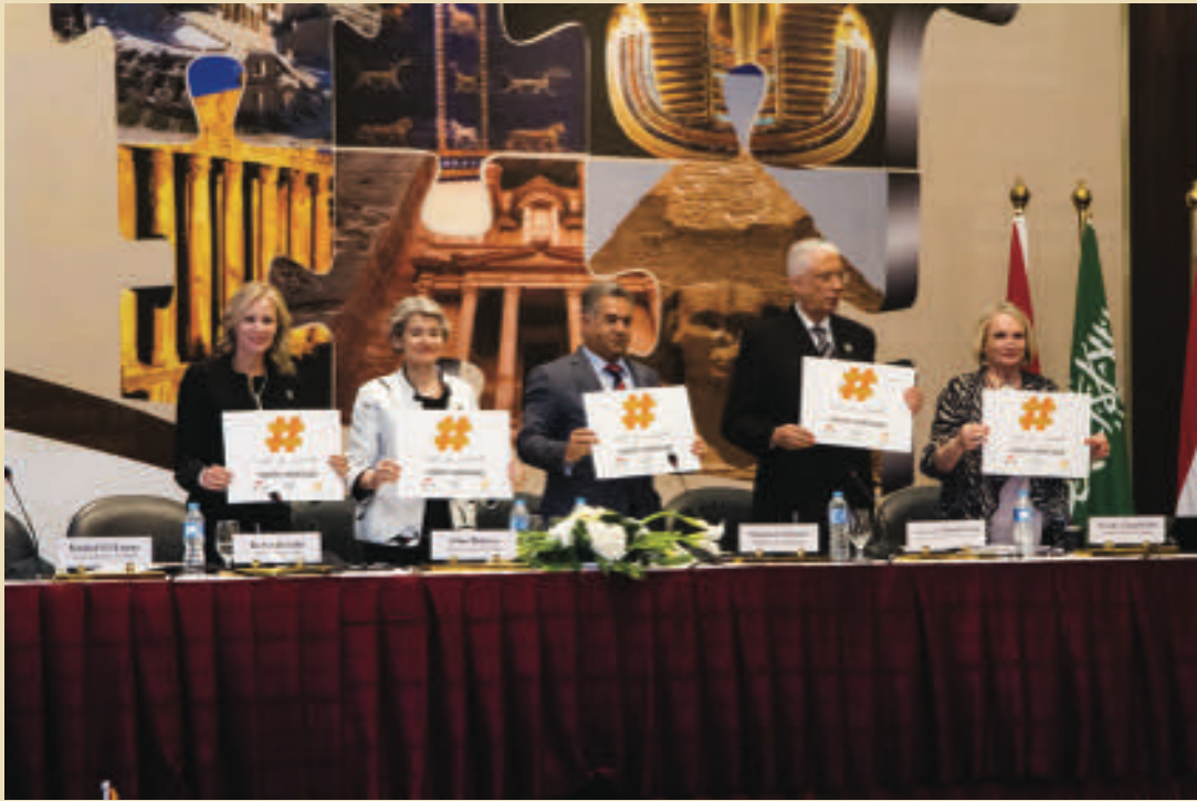
FIG. 2 Attendees at the Antiquities Coalition's Cairo Conference in spring of 2015.