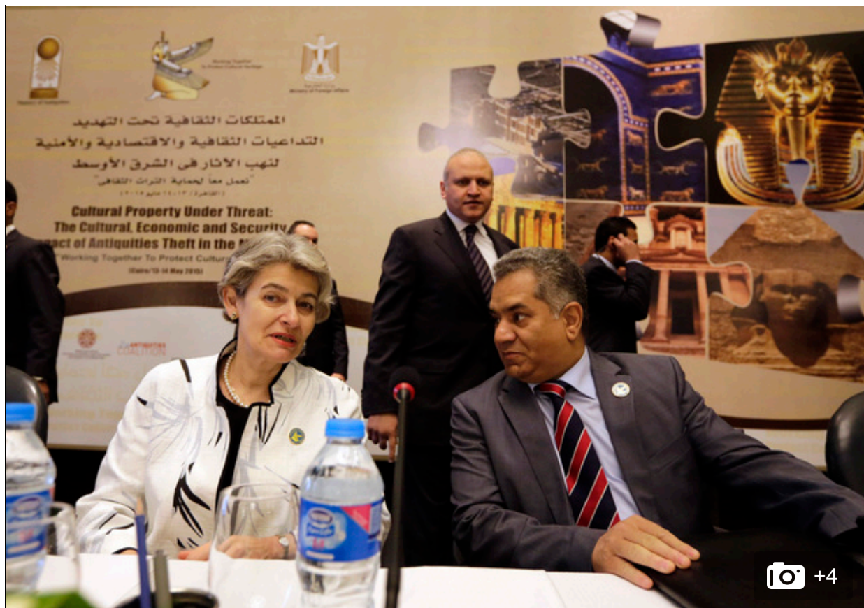
UNESCO Director-General Irina Bokova of Bulgaria and Egyptian Antiquities Minister Mamdouh el-Damaty, attend the opening of a conference titled, "Cultural Property Under Threat," in Cairo, Egypt, Wednesday, May 13, 2015. Bokova said the destruction and looting of archaeological sites in the Middle East must be condemned as a "war crime." The two-day conference is being held in response to the destruction of ancient temples and artifacts in Iraq by the extremist Islamic State group as well as the looting and smuggling of antiquities in Iraq, Syria, Egypt and Libya.

Libya, which has been in much worse turmoil since the revolt against dictator Moammar Gadhafi in 2011, is thought to be suffering from the same problem, but there were no estimates of the value of its illicit trade in antiquities.