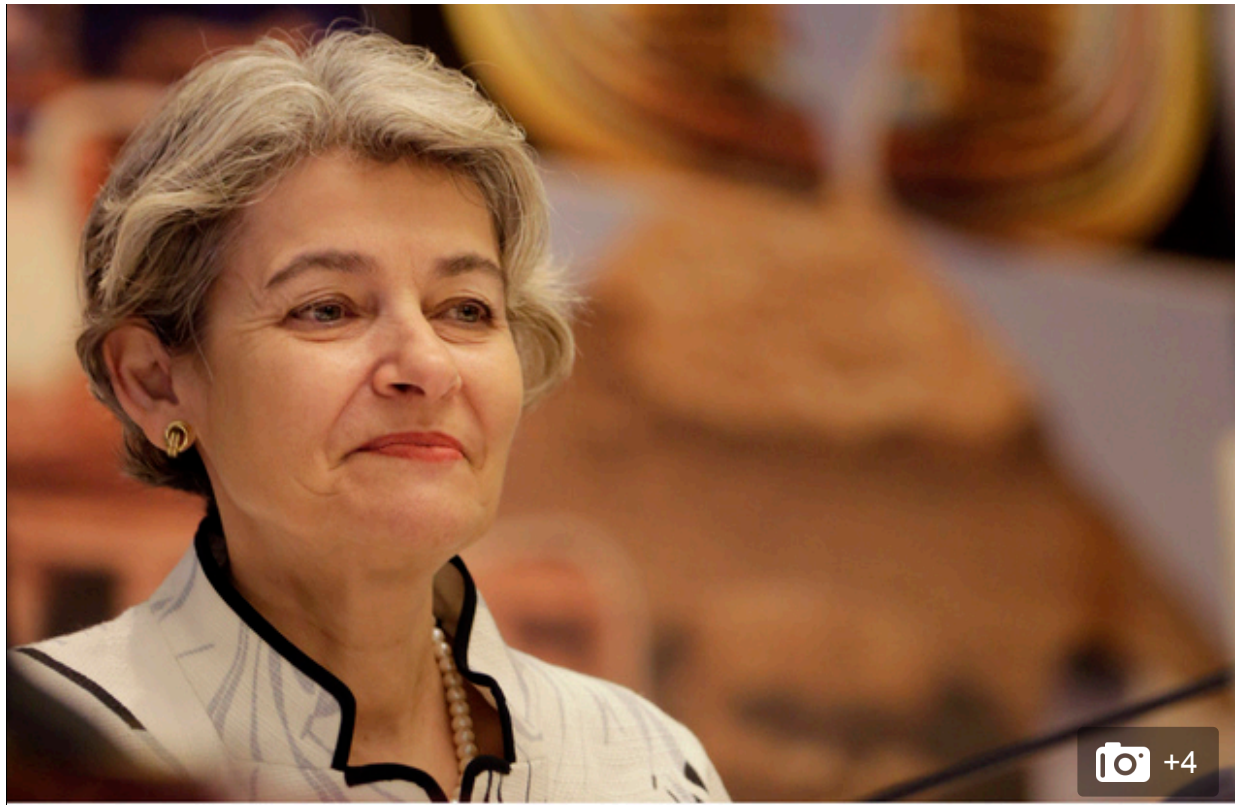
UNESCO Director-General Irina Bokova of Bulgaria attends the opening of a conference titled, "Cultural Property under Threat," in Cairo, Egypt, Wednesday, May 13, 2015. Bokova said the destruction and looting of archaeological sites in the Middle East must be condemned as a "war crime." The two-day conference is being held in response to the destruction of ancient temples and artifacts in Iraq by the extremist Islamic State group as well as the looting and smuggling of antiquities in Iraq, Syria, Egypt and Libya.

"The stakes are high," declared Bokova. "The destruction and looting of archaeological sites and museums have reached unprecedented levels. The destruction of cultural heritage, the cultural cleansing, is being used as a tactic of war to terrify populations, to finance criminal activities and to spread hatred."