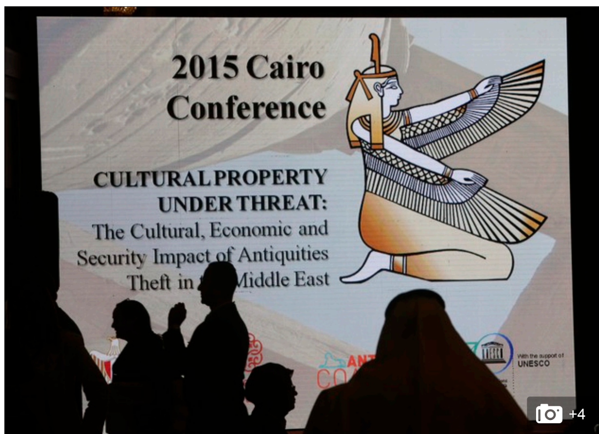
Participants walk past a banner for a conference, in Cairo, Egypt, Wednesday, May 13, 2015. UNESCO Director-General Irina Bokova of Bulgaria said the destruction and looting of archaeological sites in the Middle East must be condemned as a "war crime." The two-day conference is being held in response to the destruction of ancient temples and artifacts in Iraq by the extremist Islamic State group as well as the looting and smuggling of antiquities in Iraq, Syria, Egypt and Libya.