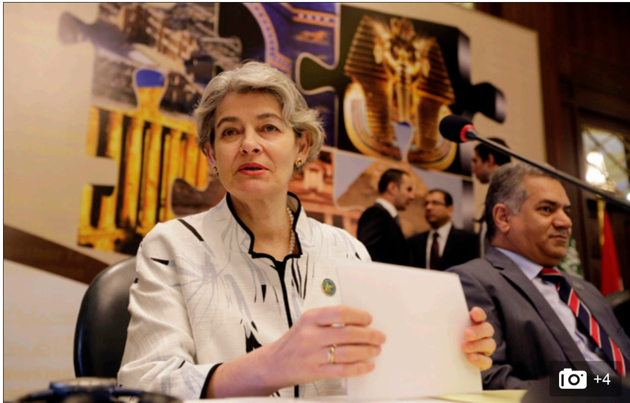
UNESCO Director-General Irina Bokova of Bulgaria and Egyptian Antiquities Minister Mamdouh el-Damaty, attend the opening of a conference on "cultural property under threat.", in Cairo, Egypt, Wednesday, May 13, 2015. Bokova said the destruction and looting of archaeological sites in the Middle East must be condemned as a "war crime." The two-day conference is being held in response to the destruction of ancient temples and artifacts in Iraq by the extremist Islamic State group as well as the looting and smuggling of antiquities in Iraq, Syria, Egypt and Libya.